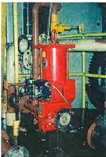
Series 5200 Control Pinch Valve provides precise control and durability. No maintenance or downtime on sugar syrup service is required during the campaign.

The sugar syrup flow must be controlled accurately. The addition of